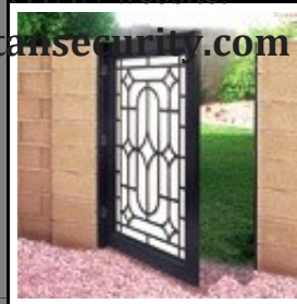
Solid Metal Backing