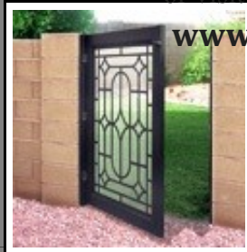
Perforated Metal Backing